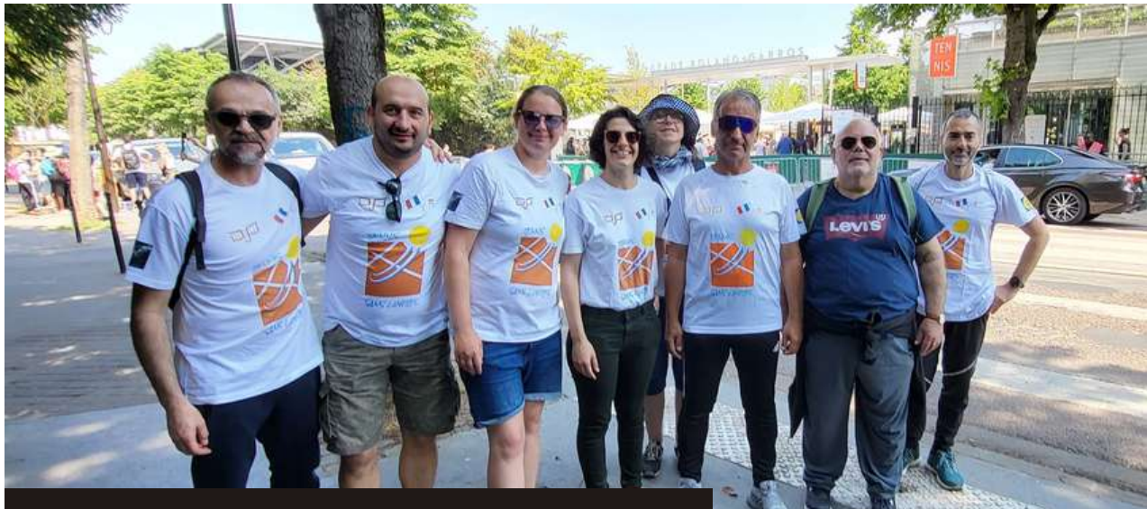
OJO Corporate Social Responsibility